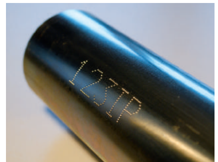
Marking on a steel tube