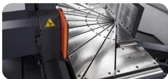
Heavy-duty miter-cutting work table & large scrape-free vise plates

* Design and specifications are subject to change without notice & obligation. * Machines may be shown with some options.