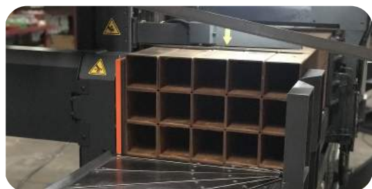
Full stroke hydraulic vises & servo motor driven shuttle bed