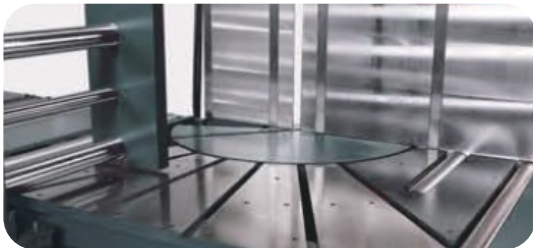
Heavy-duty miter-cutting work table & large scrape-free vise plates